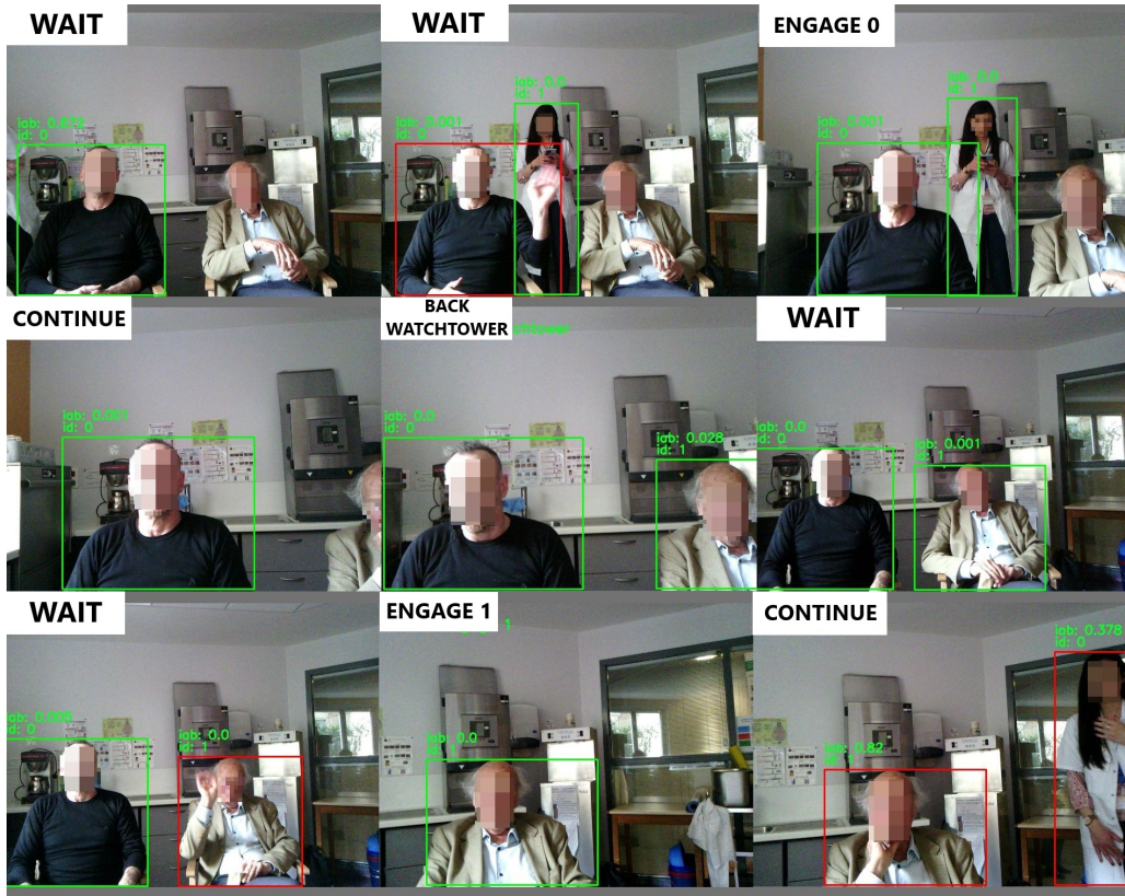
Figure 3: Example sequence of anonymised images showing patients' engagements the the hospital.

rors of the LLMs were present, the participants did not overly penalize inconsistencies in the dialogues (Q6). In general, participants find this human-robot interaction system simple and effective in terms of usability, capable of building trust with the patient, but they are not inclined to use it or face it frequently.