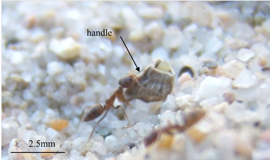
405 Fig. 3